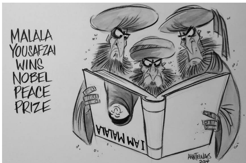
Figure 2 “Malala Yousafzai Wins the Nobel Peace Prize; The Taliban’s Reaction” by Ann Telnaes, Washington Post (October 10, 2014). © 2014 by Ann Telnaes. Image courtesy of Ann Telnaes and the Cartoonist Group. All rights reserved. A color version of this figure is available online.

cially those that are valorized in today’s neoliberal context—are assumed to be properties that one acquires due to exposure to Western/Enlightenment/humanitarian ideas and education. Thus, what we have is a discursive and affective impossibility for Muslims and Pakistanis as a collectivity to inhabit spaces that are constituted as human, with all of the liberal humanist paraphernalia of freedom, democracy, and rationality.